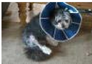
"Sammie" - saved by NJAFA Owner said he would "beat to death"

donating on-line via PayPal at www.njafa.org