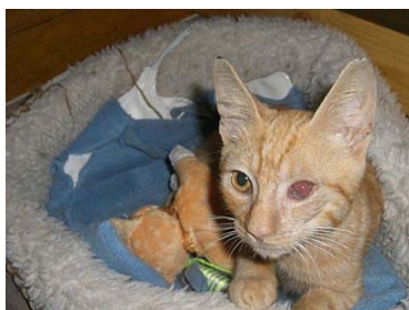
"Frankie" - rescued by NJAFA