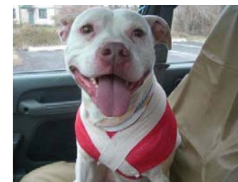
"Ninja" - saved by NJAFA

We strive to spay and neuter, enrich lives, report abuse, and seek justice for abused, neglected, and abandoned animals